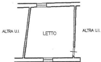
PIANTA PIANO SECONDO H = 2,55 m