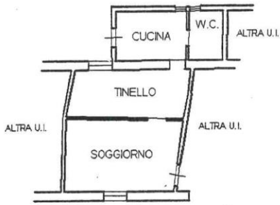
PIANTA PIANO TERRA H = 2,35 m